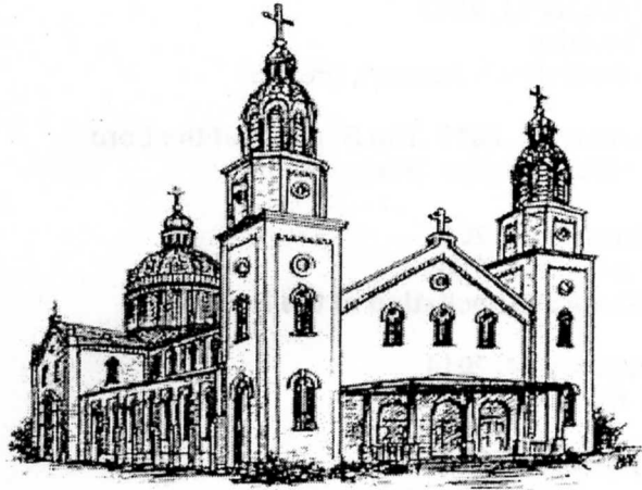
Church of St. Adalbert 212 Stanislaus Street Buffalo, NY 14212