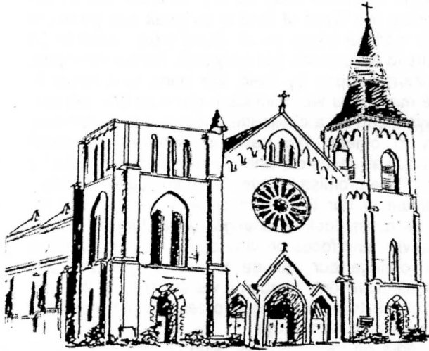
St. John Kanty Parish Community 101 Swinburne Street Buffalo, NY 14212