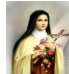
Triduum to St. Therese